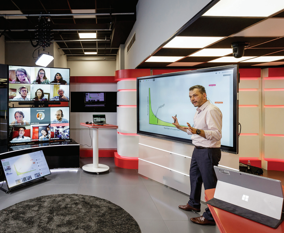
at IESE Business School.

We use the same methodology - a rich discussion of a case - in a virtual context where remote students can engage with the debate.